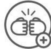
Create a team