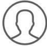
As an individual