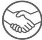
Join a team